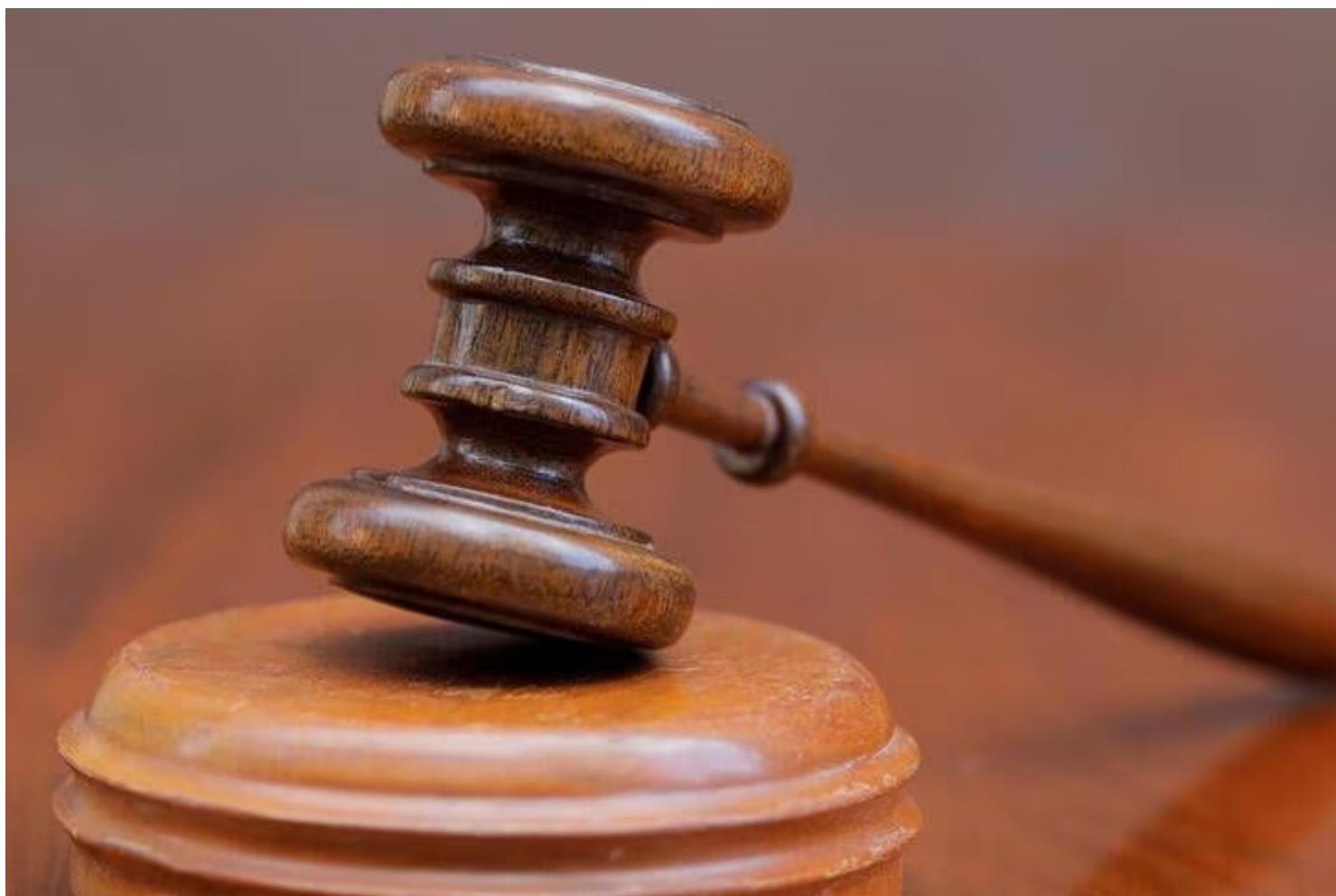
A gavel and a block is pictured in Manhattan, New York City, U.S., August 18, 2020.